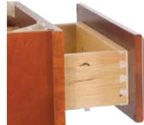
Dovetail Drawer Box