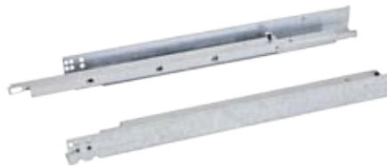
Soft-Close Undermount Slides