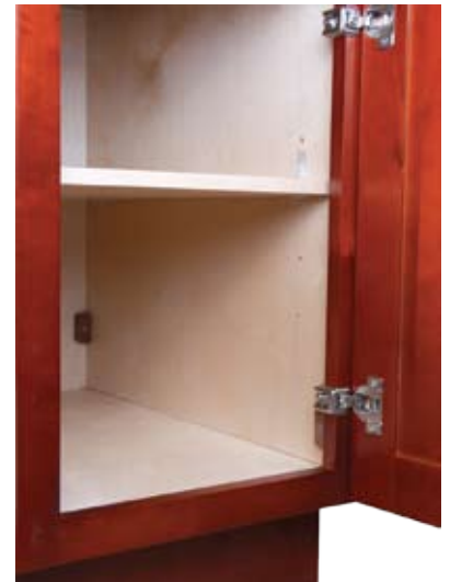
Natural Interior Finish