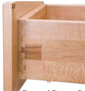
Dovetail Drawer Box