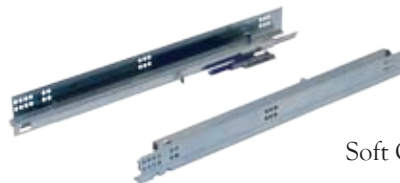
Soft Close Undermount Slides